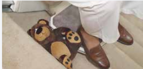
Safety Obstruction Sensors

Other Pinnacle perks include standard features such as: