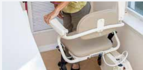
Manual Swivel Seats for Safer Exits